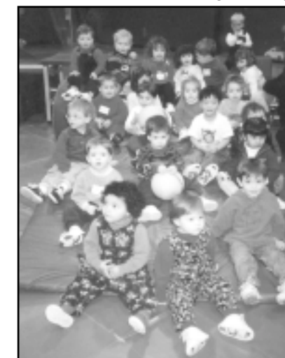
There are programs for residents of all ages at the Rec Center this summer.

Classes begin September 13 and follow the RVC public school holiday schedule. Call 678-9338 for information.