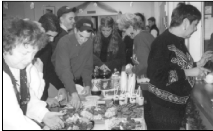
The Intergenerational Picnic with students from South Side High School and members of the Sandel Center is Thursday, June 3.