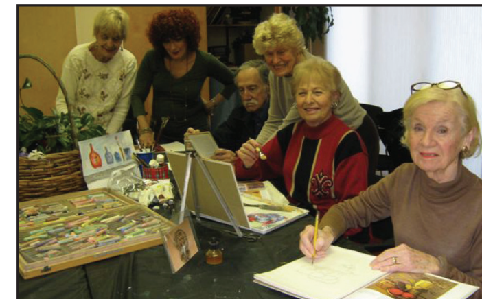
Art classes are available at the Sandel Center.

Donations and purchases support the Center's programs and services. Donations accepted beginning October 18.